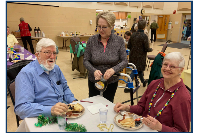
Fat Tuesday Event