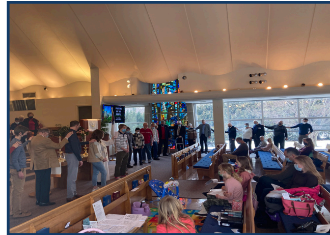
Elder & Deacon Service