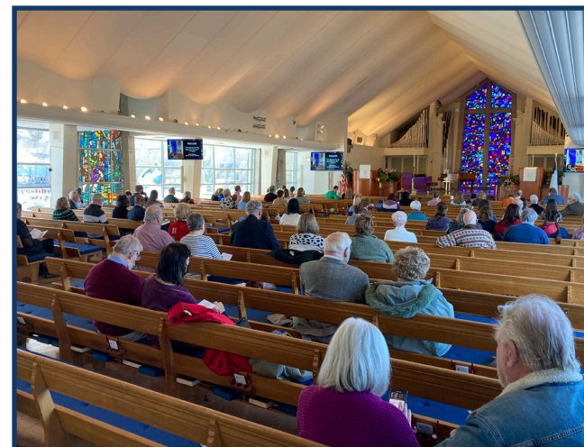
10AM Sunday Worship