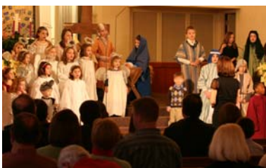
Christmas Eve Family Service