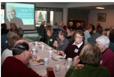
“Prime Time” Luncheon