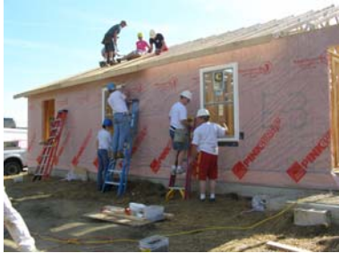
Habitat for Humanity