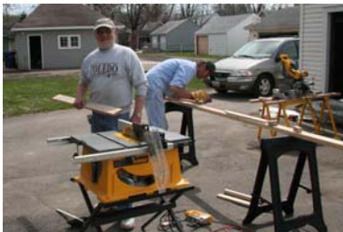
Iowa Mission Trip